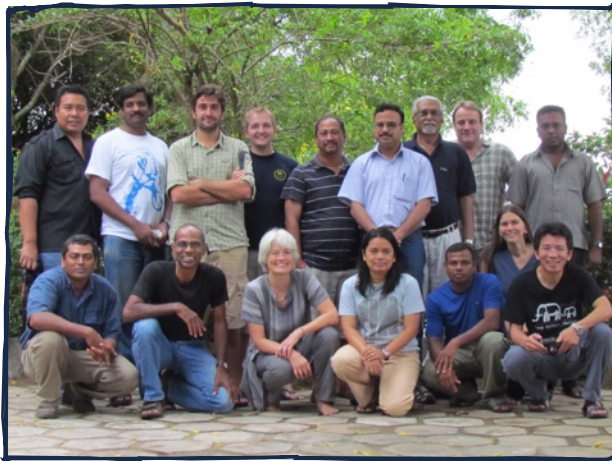
Elephant Conservation Group, Sri Lanka, Mar 2011

ECG stands for the Elephant Conservation Group , an informal network of Asian elephant research and conservation projects from 8 Asian countries. ECG was established in March 2011 with the objective of standardize methods and objectives in the study and mitigation of human-elephant conflicts (HEC) in different scenarios in Asia. In our initial workshop in Sri Lanka we agreed on conducting a coordinated survey to understand differences and similitudes of people's perceptions and attitudes towards HEC in our study sites. Eight months later we have concluded the data collection in most of the project sites and our analyses are very advanced. We are now looking forward to a second workshop in March 2012 to advance further our common work.