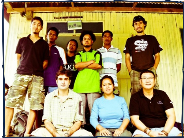
Rimba and MEME members, Kuala Basung, Sep 2011