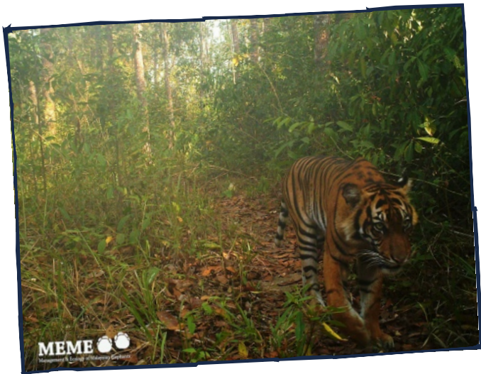
A critically Endangered Sumatran tiger captured in one of our camera traps