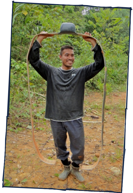
How big are elephant GPS-collars? This big!